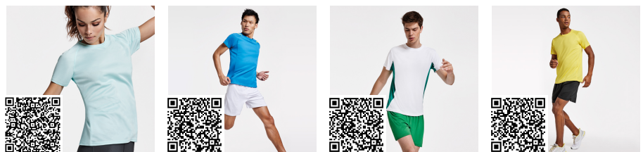
BAHRAIN WOMAN CA0408