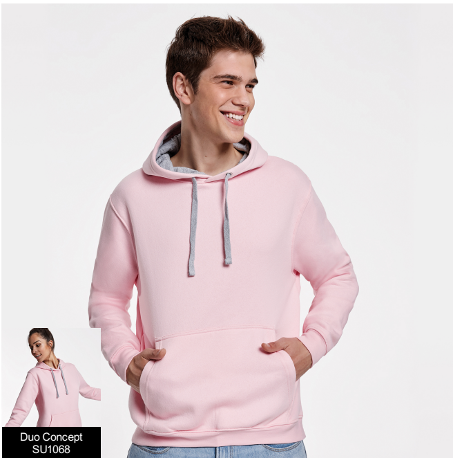
Duo Concept SU1068